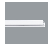
Mounting ERCO 3-circuit track Hi-trac 3-circuit track